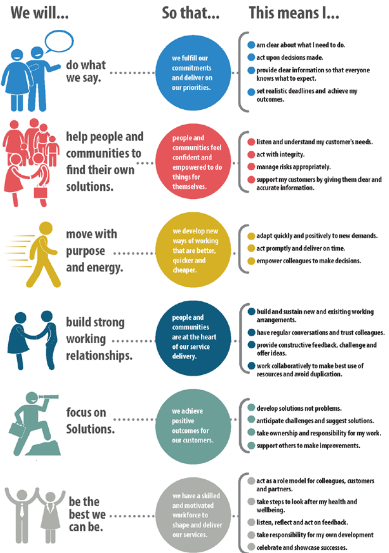
Figure 2 Warwickshire's Six Key Behaviours